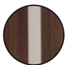
Walnut Trio with Maple inlay