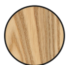
Ash Solo Solo