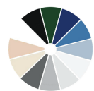
Any Colour Painted hardwood